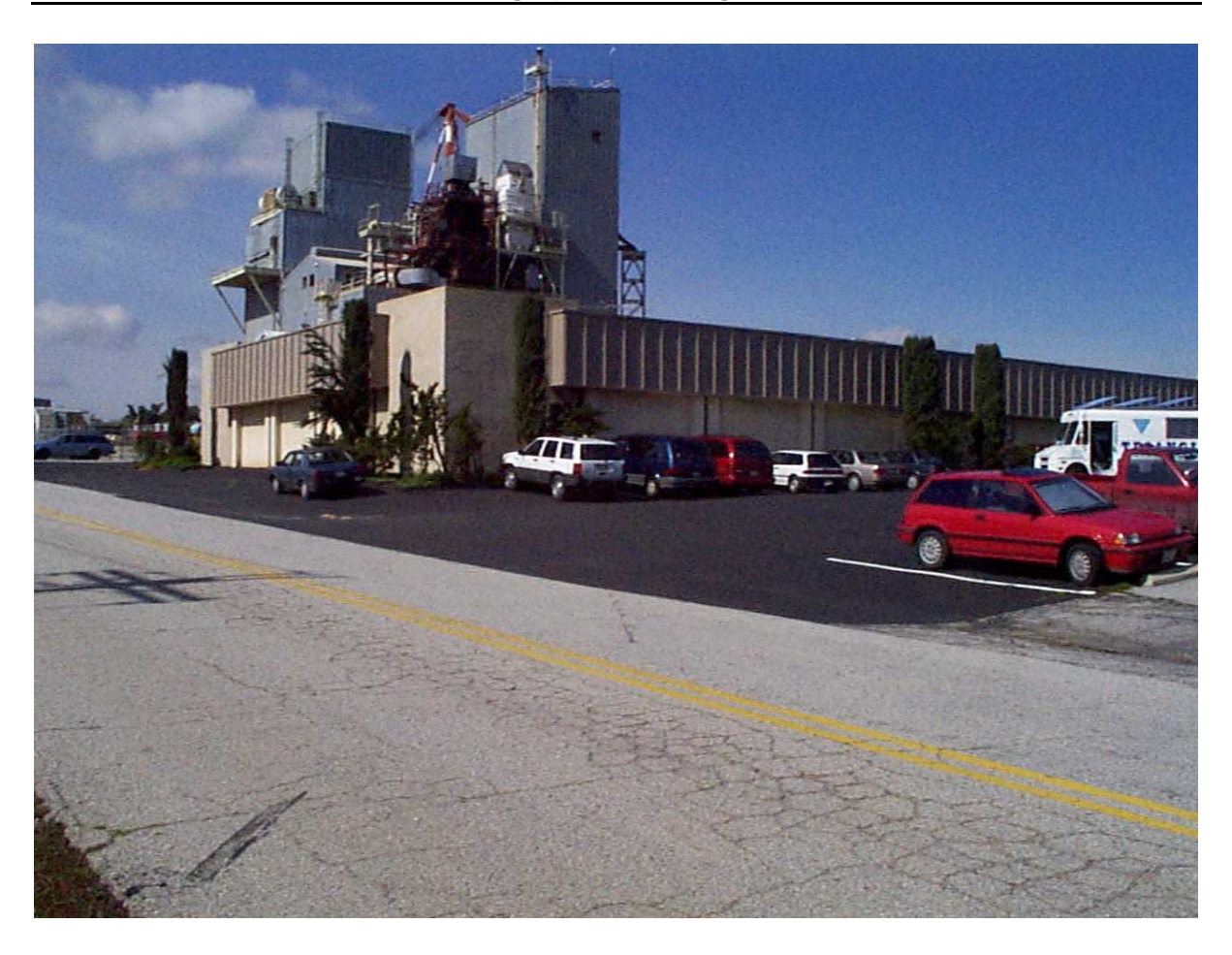
Photograph – Building 4487