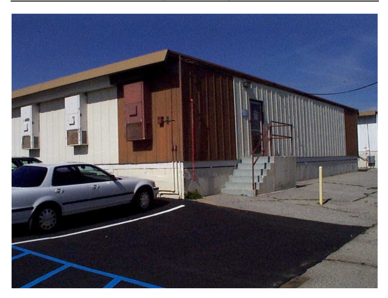
Photograph – Building 4485