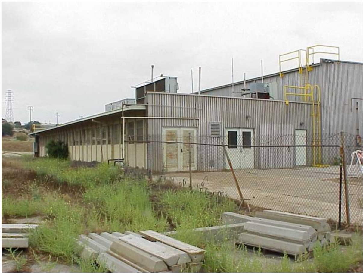
Photograph – Building 4011