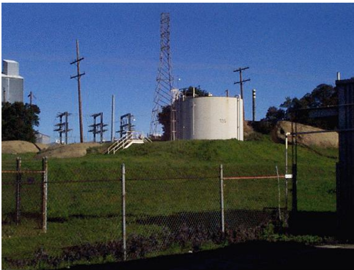
Photograph – Fuel Tank 4735