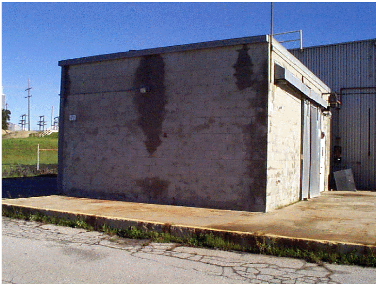
Photograph – Building 4172