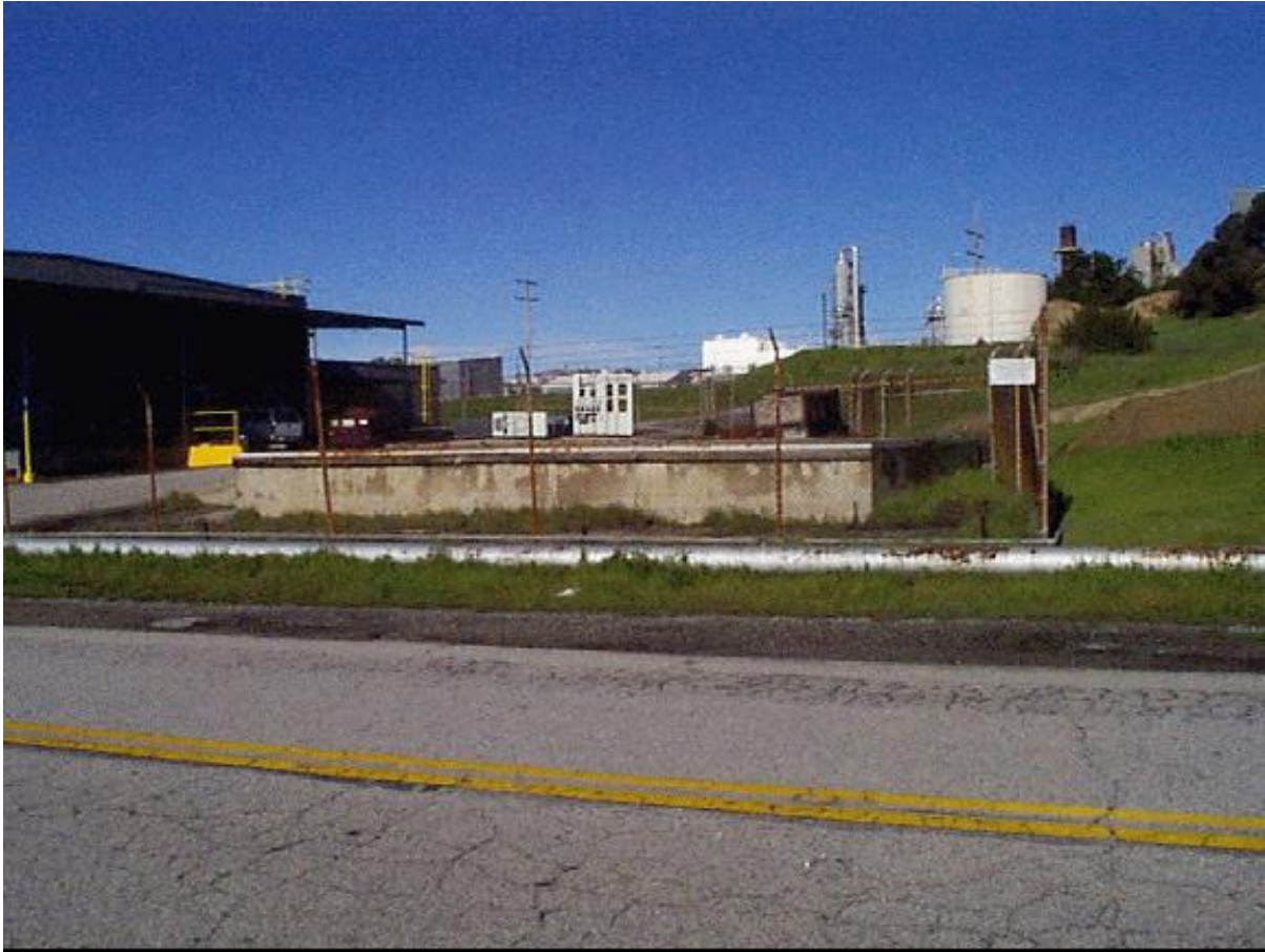
Photograph – Building 4500