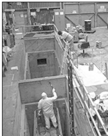
RMHF Workers at Building 4022 in 2005

The RMHF was designed and constructed in 1959 for the safe storage and handling of new and irradiated nuclear fuel and other radioactive materials. The RMHF operated in its original capacity until research at ETEC involving radioactive materials was completed in 1988. When the DOE-sponsored activities at ETEC began to focus on the D&D of the ETEC facilities, the RMHF was dedicated to the exclusive support of D&D activities at SSFL. In this capacity, only radioactive and mixed wastes were managed at the RMHF.