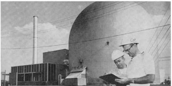
ATOM POWER — Giant atomic electric plants like Hallam Nuclear Power Facility, shown left, are being developed by AI. Interior shot of reactor floor shows tower-like fuel handling crane, and circular control rod housing at lower center. Right, Piqua Nuclear Power Facility, built by Atomics International, is the nation's first organic reactor to produce commercial power. The Piqua plant, under direction of AI, has been producing electricity for over a year.