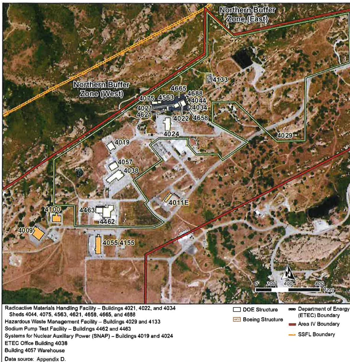
Figure 7-1. Remaining Structures in Area IV (from the Final EIS for Remediation of Area IV and the Northern Buffer Zone of the Santa Susana Field Laboratory )